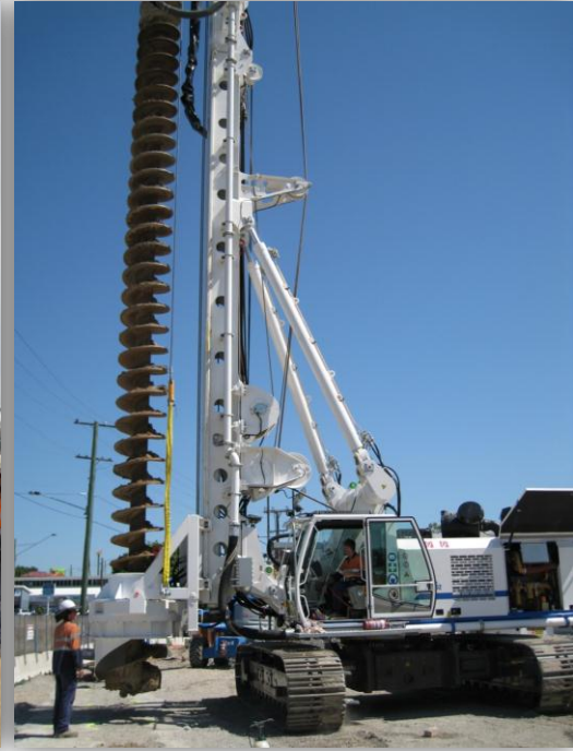
CFA Set Up