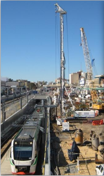
Bored Pile Set Up